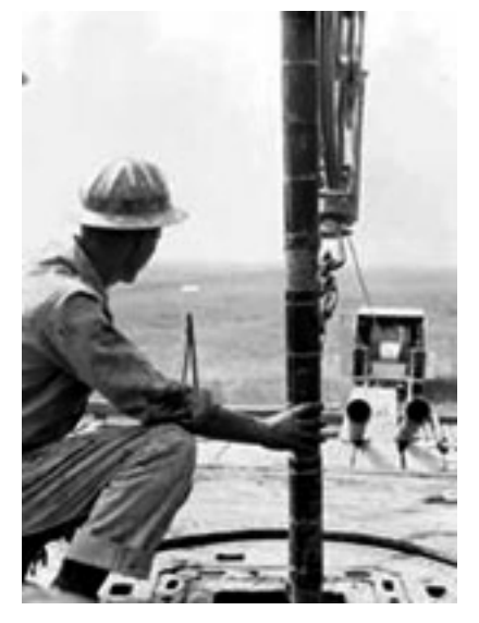
A logging tool about to be lowered into a well

In 1927 the Schlumberger brothers made the first electrical log in France. An early electrical log is shown in the Science Lab experiment The Electrical Resistivity of Materials. It shows the electrical resistivity of the ground at different depths. This information can give an indication of what is in the ground. Oil soaked rock generally has a high resistivity while water soaked rock has lower resistivity. That's useful information to people looking for oil, but it's not the whole story. In Nuclear Magnetic Resonance Six Miles Deep you can learn about another logging technique that provides additional information about the subsurface.